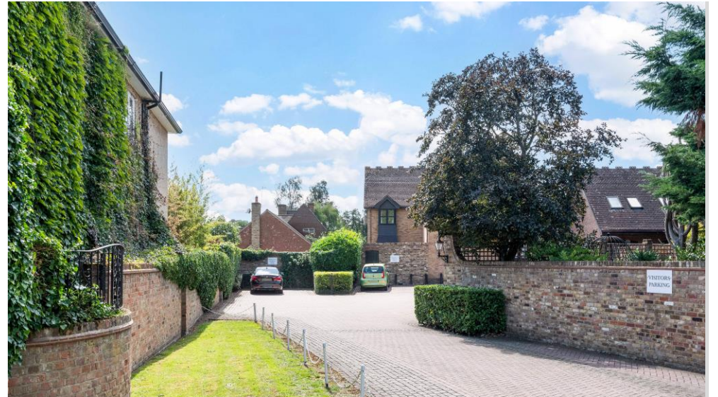
CLARENDON MEWS BEXLEY KENT DA5 1JS GUIDE PRICE: £240,000 | Leasehold